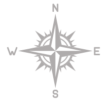
Map not shown to scale.