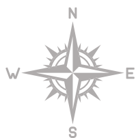
Map not shown to scale.